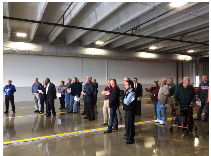
Interior of addition.