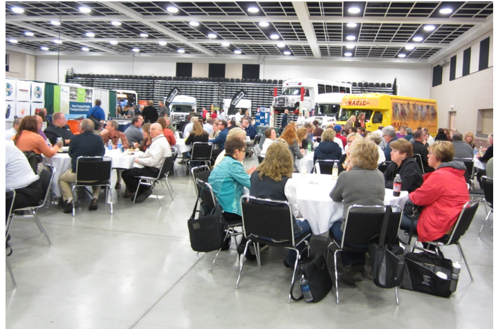
Vendor Expo - 20+ vehicles on display