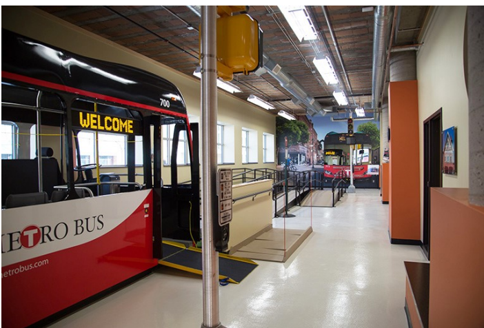
Educational tours and trainings