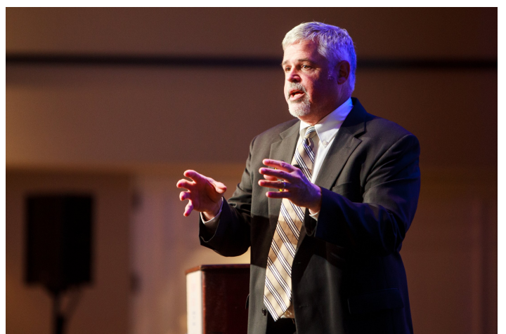
Engaging keynote speakers