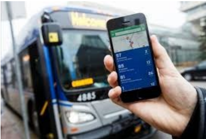
Sessions focused on tech and the future

Visit our website for MPTC registration and more information