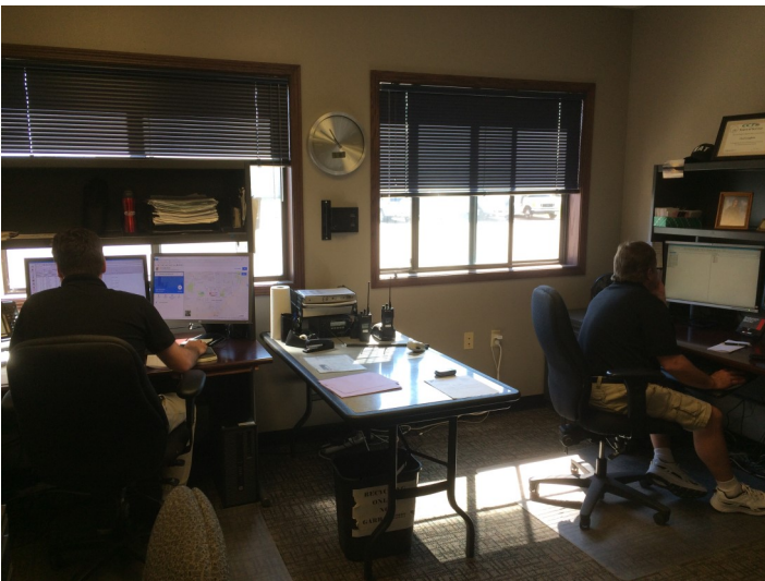
Employees hard at work at Central Community Transit.

In October 2016, MPTA received a Local Transit Coalition Grant from the American Public Transit Association (APTA). The grant funds a MPTA initiative to better inform transit systems of the variety of technological options available to them. One of our goals with this project was visiting five systems for conversations about technologies, and in May and early June 2017 I met with representatives from seven transit systems in their communities.