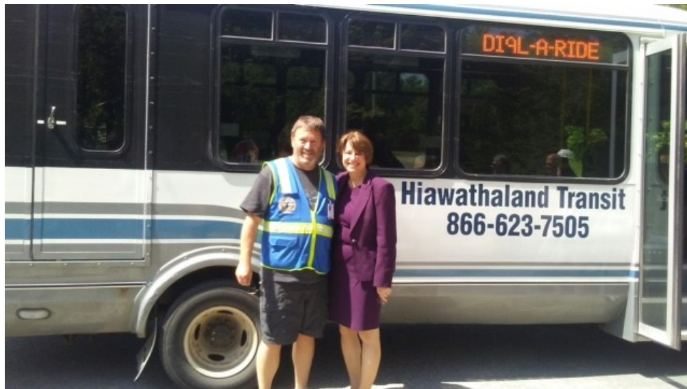
Senator Amy Klobuchar visited Hiawathaland Transit on June 9th.

The capital bonding bill – HF5 – contains funding for 2 transit projects: the Mall of America transit station ($8.75M) and the Orange Line ($12.1M).