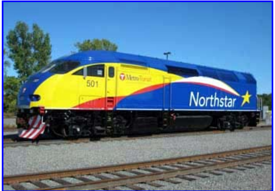
The first of five new locomotives for the Northstar commuter rail arrived in Big Lake, Sherburne County, on October 3. The rest will be delivered later this year. Service begins in late 2009.

Each train set, or “consist” (pronounced CON-sist), will include a locomotive, three coaches and a cab car, with total average seating for about 550 riders.