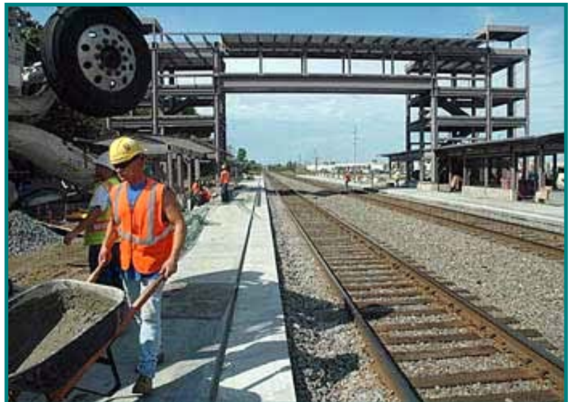
At the Coon Rapids station, under construction, passengers will cross over the tracks through a two-story glass-enclosed walkway that connects a parking lot on the northbound side of the tracks with the boarding platform on the southbound side.