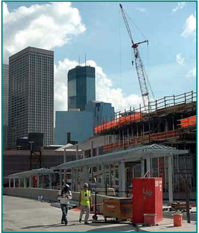
In downtown Minneapolis, Northstar will connect with Hiawatha light-rail at a new, two-story intermodal station at the new Twins ballpark. The station is under construction, and located about three blocks north of Hiawatha's current terminus near First Ave. N.

Located at Main Street and 60th Ave. N.E., the station site is now being prepared for a boarding platform and adjacent parking. The ACRRA has already funded construction of a pedestrian tunnel under the BNSF train tracks, and has acquired land for a park-and-ride lot adjacent to the station. Advance site prep will speed up actual construction when local funding becomes available.