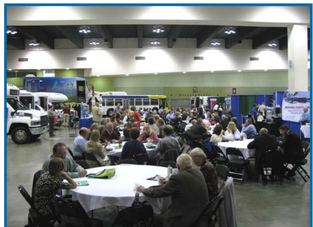
Vendor Expo Lunch