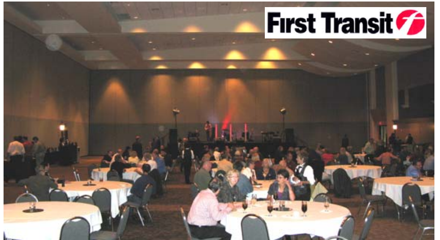
First Transit Reception with Belladiva entertainers.