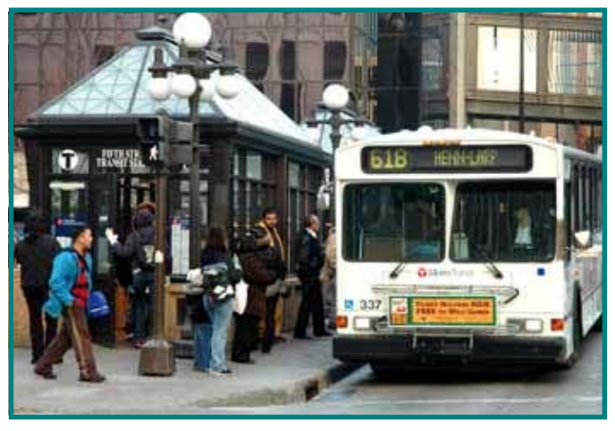
The "lights-on" transportation finance bill passed by the Legislature doesn't allow for the region to expand its transit system to keep pace with the region's growth.

A separate bill that included language clarifying the Council's authority to build LRT lines failed to win final legislative approval. The Council will continue leading the project in concert with the Minnesota Department of Transportation, which has such statutory authority.