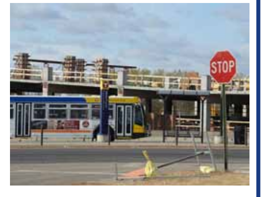
Construction is under way at the Maplewood Mall Transit Center to add 1,000 park-and-ride spaces.

"Four of Northstar's five park-and-rides have seen double digit growth rates over the past year," he said <u>Read more.</u>