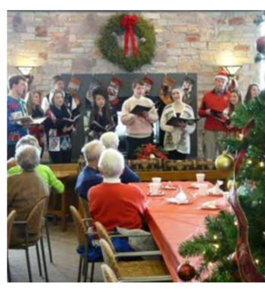
In December, SouthWest Transit hosted an event for seniors, which included a performance by an Eden Prairie high school choir and a trip to the Minnesota Landscape Arboretum.

And in December, riders and staff donated toys and food for the annual Toys for Tots drive and local food shelves, and many rode our Holidazzle Express. SWT once again hosted an event for local seniors at the Chaska Lodge with an Eden Prairie high school choir performing, followed by a trip to the Minnesota Landscape Arboretum.