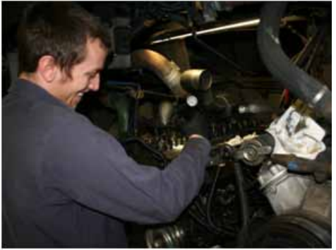
SouthWest Transit maintains a fleet of 61 buses.

SouthWest Transit (SWT) prides itself on its safety record and recognizes the effort its vehicle technicians plays in this success. A recent article in the SunCurrent newspaper let the public know that a lot of work goes on behind the scenes to keep our fleet of 61 buses on the road, in good repair.