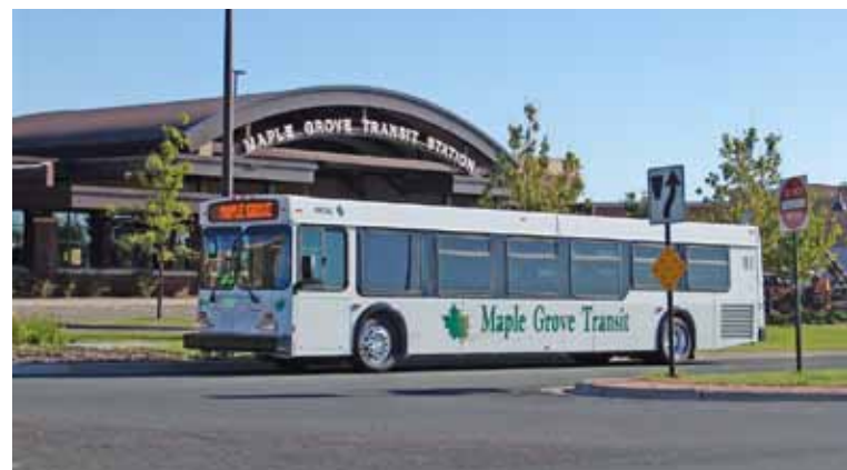
buses. MGT also offers a dial-a-ride program using four vans for paratransit service within Maple Grove.

The City of Maple Grove established Maple Grove Transit (MGT) in June 1990. MGT has an eight-member Transit Commission to provide user input into the operation and planning of the system. Presently, MGT has commuter express service to and from Minneapolis utilizing 47 round trips on five routes. The commuter service utilizes five park-and-rides lots and fleet of 35