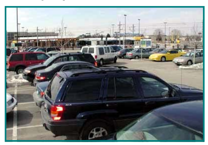
The 28th Avenue light rail transit station's park-and-ride lot is routinely full. A new ramp will be constructed there starting in mid-April.

Across the system, customer demand for park-and-ride facilities continues to be high. Since 1999, the region has expanded park-and-ride capacity by 177 percent, but the number of users has grown 223 percent. The 28th Avenue Station parking ramp is one of more than a dozen major facilities set for building or expansion between now and 2010.