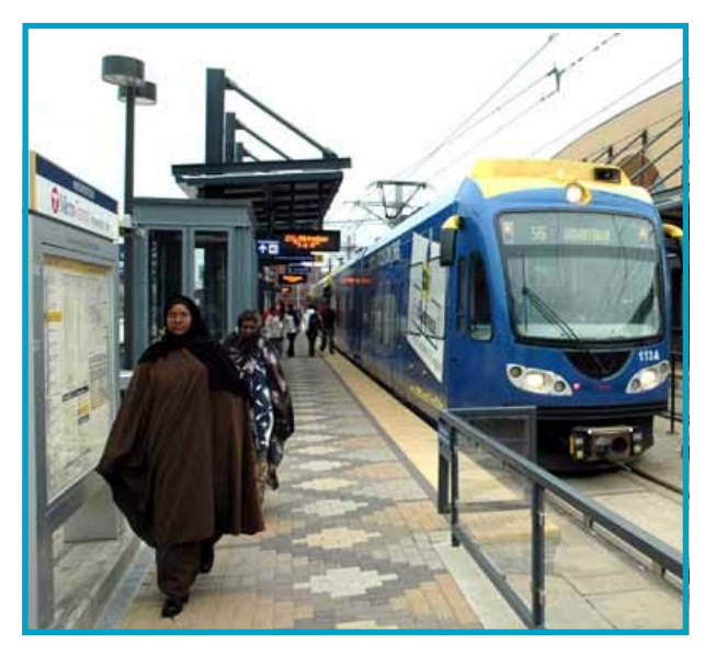
Half of all rail riders surveyed said they would get to their destination by driving alone were it not for the train.

Metro Transit conducts the research to measure system-wide customer service and satisfaction levels. The latest survey represents the twelfth wave of research on buses and the third for light rail.