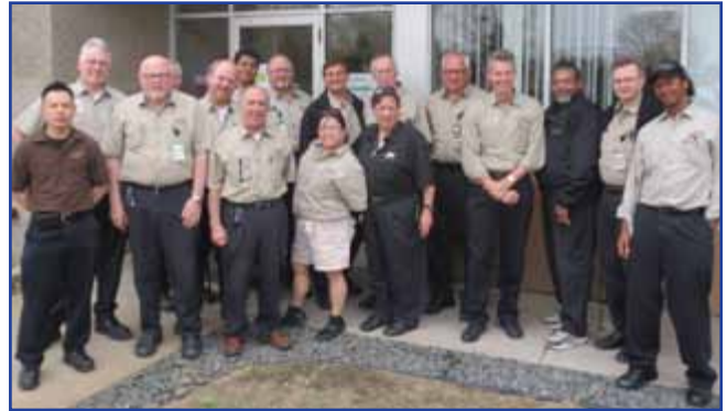
Just some of the SouthWest Transit GOLD Award winners

Once eligible, operators are scored on the following criteria: following all policy and procedures daily, maintaining on-time performance, making required public announcements, having no “at fault” customer complaints, and maintaining acceptable attendance and punctuality.