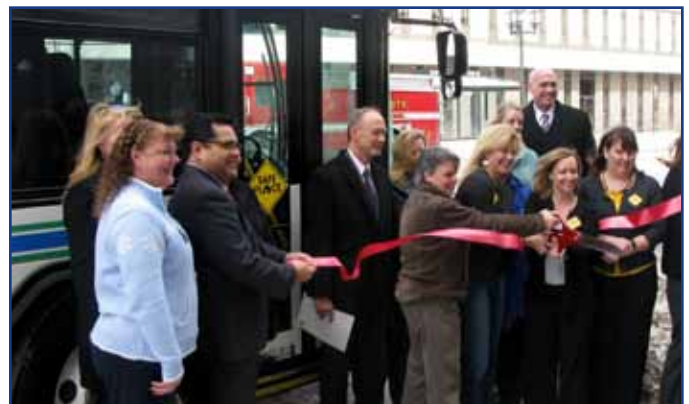
Safe Place ribbon-cutting ceremony with DTA, Lutheran Social Service and Duluth Chamber of Commerce representatives

According to Wilder Research, 2,500 youth are homeless on any given night in Minnesota. More than 40 percent live in Greater Minnesota. Lutheran Social Service's three emergency crisis shelters in northeastern Minnesota served over 800 youth in 2012.