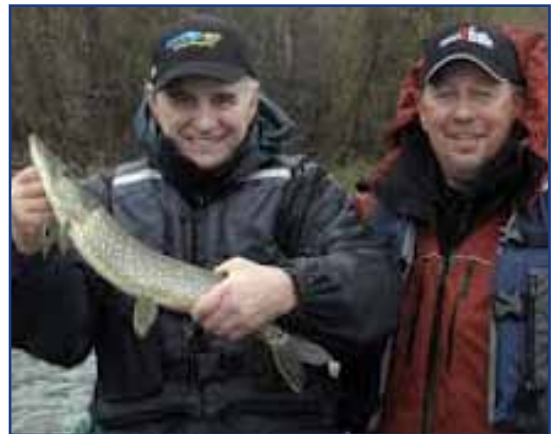
Cold weather didn't deter the fish from biting!

One of the first collaborations involved Hubbard County contracting with Paul Bunyan Transit to dispatch the Park Rapids City bus service through the use of AVL equipment and software dispatching system. As a result of that collaboration, city ridership increased by about 16 percent overall and Hubbard County increased its capacity without increasing service hours. It has been a great partnership since it began in 2011. In addition, this year the system was able to pursue establishing its second collaborative with a new route serving northern Hubbard County and southern Beltrami County in and out of Bemidji 5 days per week.