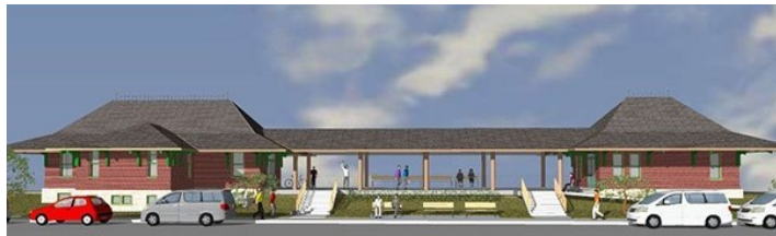
Preservation group Save the Northfield Depot says the 1889 depot (left) would complement the proposed transit hub (right) . Rendering credit: Save the Northfield Depot

Like Minnesota Public Transit Association on Facebook and follow @MNPublicTransit on Twitter for: — Coverage of MPTA events, including the conference in September — News and retweets from MPTA members — Local and national media coverage of transit news and issues