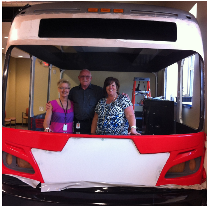
Mobility Training Center staff pose during a facility tour earlier this summer.

The Mobility Training Center houses the successful Travel Training program, which gives specialized training to seniors, people with disabilities and people with limited English proficiency to help them learn how to use Metro Bus services. Through this program, we have partnered with more than 70 social and support agencies to provide free travel training to staff and clients to increase knowledge and use of public transportation. Through this training, agencies are able maximize their transportation budgets by utilizing our Fixed Route services first, which is more economical than Dial-a-Ride, taxi service or other private transportation.