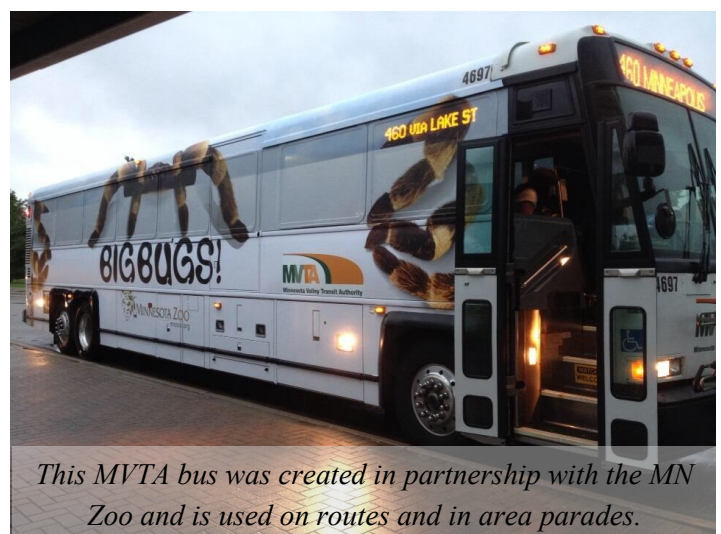
This MVTA bus was created in partnership with the MN Zoo and is used on routes and in area parades.

Customers should watch for the Wi-Fi decal near the Boarding door, indicating that buses have free Wi-Fi. Many of the vehicles will be operating on the Cedar Avenue and I-35W corridors.