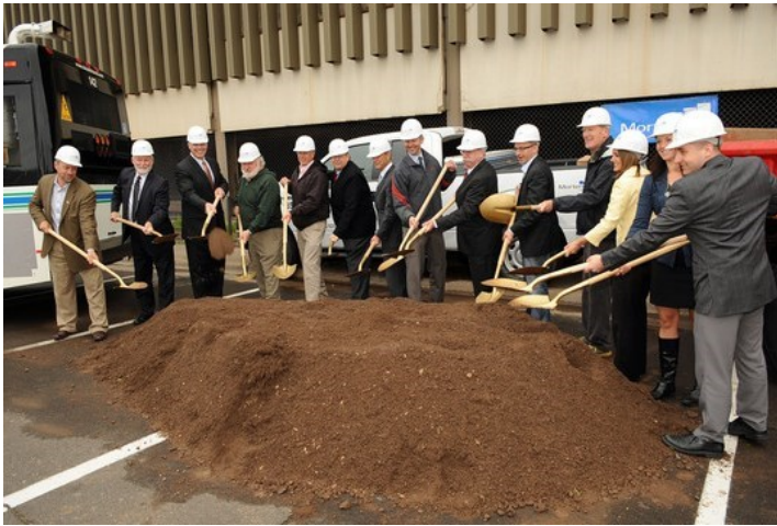
City and Duluth Transit Authority (DTA) officials break ground for construction of the new $28 million Multimodal Transportation Center.