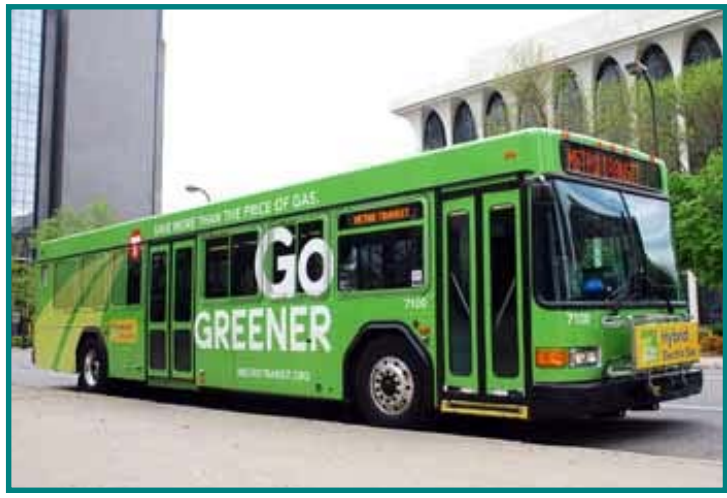
One of Metro Transit's hybrid-electric buses traverses the Twin Cities wrapped in the Go Greener message.

Metro Transit made the announcement today to highlight its Go Greener activities at the State Fair during Hop on Transit Day.