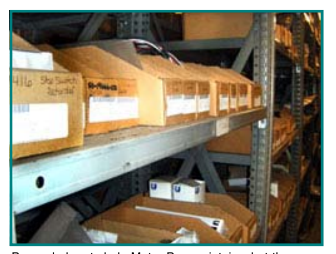
Bar-coded parts help Metro Bus maintain what they need while keeping costs down.