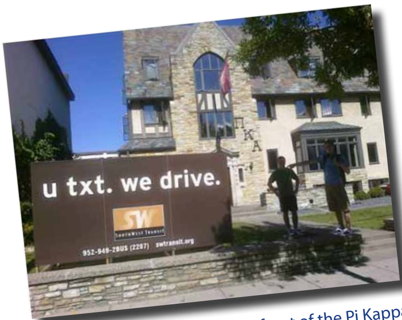
The SouthWest Transit sign in front of the Pi Kappa Alpha fraternity house reminded students not to text and drive.