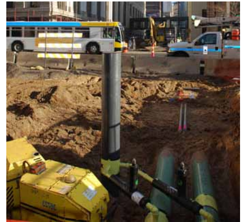
Relocation of utilities in downtown St. Paul, in preparation for construction of Central Corridor LRT, began in 2009.

Three more stations will be added to the $941 million Central Corridor light rail transit (LRT) project, thanks to a relaxation of federal rules and a commitment of additional funds. The Met Council hopes to secure FTA approval to enter final design in March and receive a commitment for 50 percent federal funding by September. Construction of the stations, to be located on University Avenue at Western, Victoria and Hamline avenues, would start this year and be completed by 2014. Read Story.