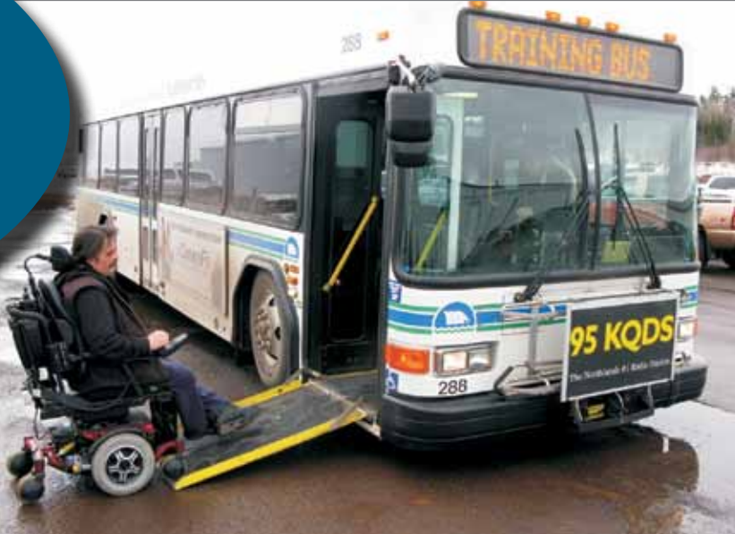
Midwest Medical trainer wheels on the bus to begin training session with DTA driver trainees.

For the past 12 years, the Duluth Transit Authority (DTA) has worked with Midwest Medical Supply to provide ADA training for new drivers on securing passengers with a variety of motorized wheelchairs. DTA trainers, as well as Midwest Medical staff, regularly conduct training sessions at Midwest Medical. Trainees are instructed on how to apply tiedowns and straps to motorized wheelchairs on the bus. Driver trainees also are instructed on passenger sensitivity and protocol required when securing disabled riders in wheelchairs. Midwest Medical Supply provides this free training to DTA drivers for the benefit of their wheelchair clients.