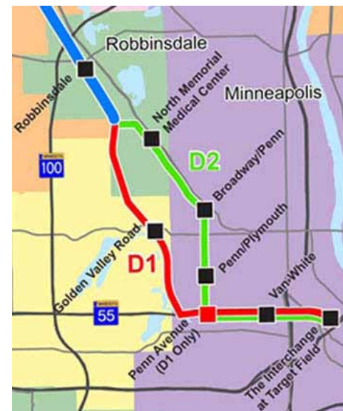
Map excerpt shows routes being considered in for the southern portion of the Bottineau Corridor.